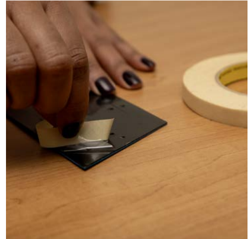
Figure 1: Peel off the thin protective film using a piece of shipping tape.